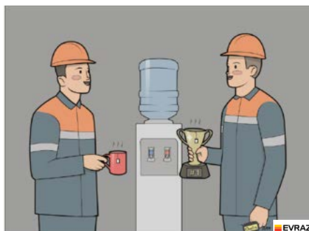
“Steel Irony” project

Lines of light were traced by flying a quadcopter above plants and quarries in the photos. Since the drone’s flight path could not be programmed, it took three to five hours to take each photo with the intended linear shape. The photos were used in the corporate calendar for 2020, as well as the new concept for EVRAZ Instagram account. The total number of views of publications about the project is estimated at 1.5 million.